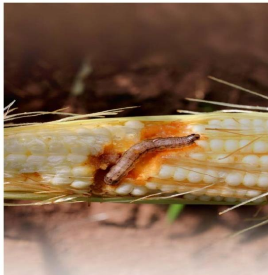
Plate 1: Larvae of fall armyworm on a maize cob

Maize crops are attacked by FAW at larval stages as seen in Plate 1. This is the most destructive phase in their lifecycle as they attack mostly the young leaves (Obok et al. , 2020). Though the larva could also feed on maize silk and tassel tissues, their major feeding site preference is the succulent and tender leaf tissues, especially at whorl stages (CABI, 2018). Perhaps mature leaves are classified as unsuitable sites for the growth and development of the pest due to their preference for tender leaf tissues (Pannuti et al. , 2016). The mouthpart of FAW larvae encourages rapid defoliation which often increases with the age of the larvae (CABI, 2018). Meanwhile, the first to third larval instar causes injuries ranging from perforations to defoliations of maize plant leaf while ribs and leaf stalks are less likely affected (CABI, 2018). However, the adult (males and females) is not destructive to host crops.